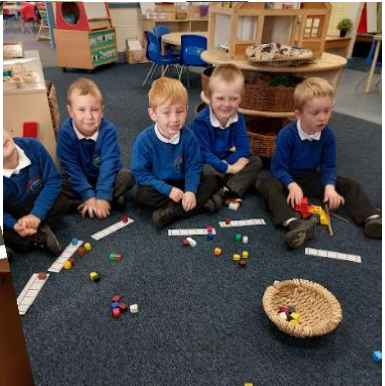
We have been learning about five frames and how to use them.

We've had lots of fun learning about numbers! We have done lots of ordering numbers 1 to ten, we especially enjoy singing our number song!