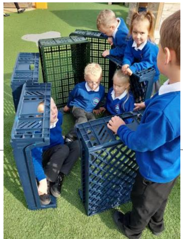
We used different resources to build our houses!